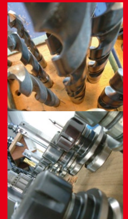
Traditional processes co-exist with modern ones, giving Harrison Billet products their unique blend of TÜV/ISO level engineering and true craftsmans finish

We believe we make the lightest, strongest, best performing Brake Calipers on the market, and take great pride in our current range of 2-piston, 4-piston, Mini-6, BIG-6, SLIMS and 800 SERIES Calipers, Discs and Brackets.