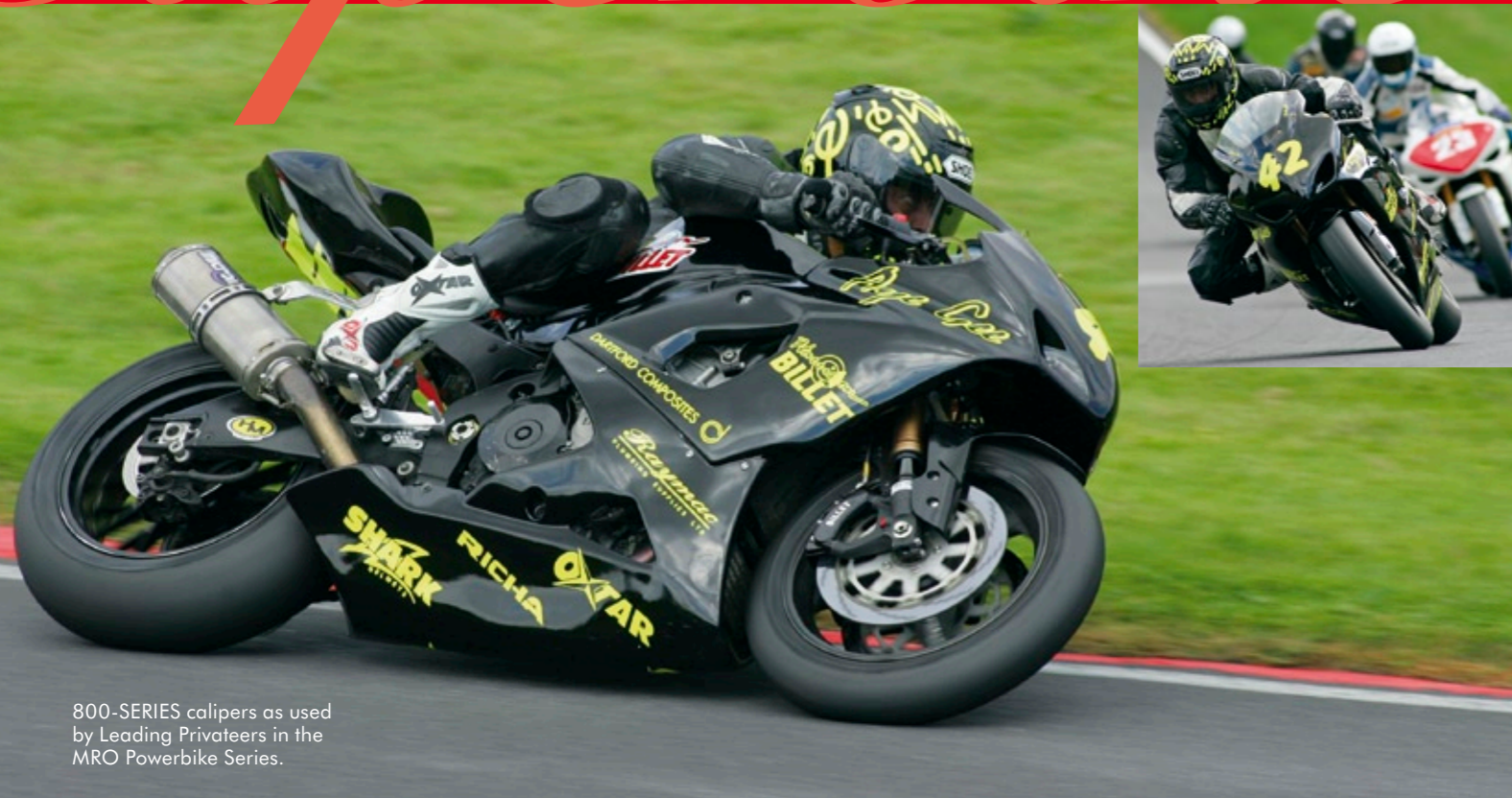
800-SERIES calipers as used by Leading Privateers in the MRO Powerbike Series.